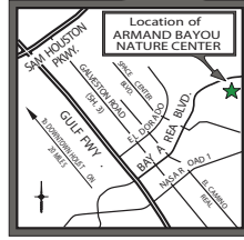
INSET MAP Not To Scale